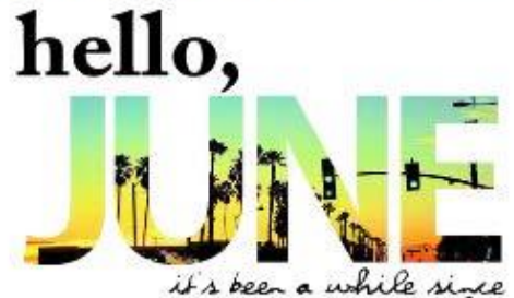
ive seen you last

Information adapted from https://www.mayoclinic.org/healthy-lifestyle/ healthy-aging/in-depth/aging/art-20046070